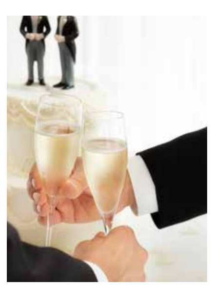
Our wedding Bubbles flowed!

Attended the Preparation Workshop – was also a chance to meet others going through the same thing.