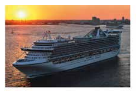
We met whilst working at sea.